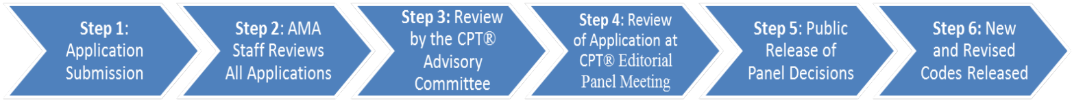
Figure 1: CPT® Code Application Process

The Panel meets three times a year, and meetings are open to the public. Meeting registration and agenda information are available online .